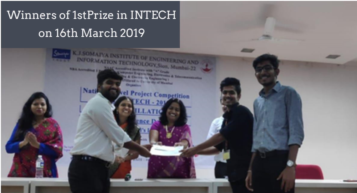
Winners of 1st Prize in INTECH on 16th March 2019