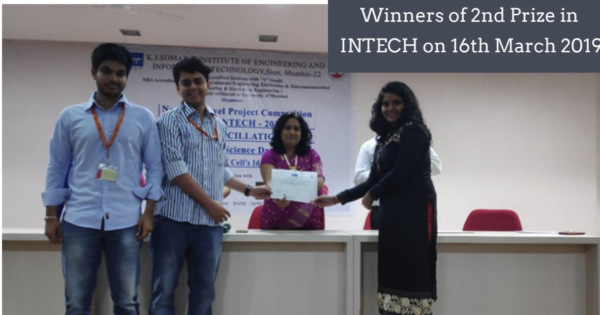
Winners of 2nd Prize in INTECH on 16th March 2019